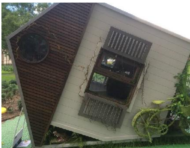
Unusual cubby house