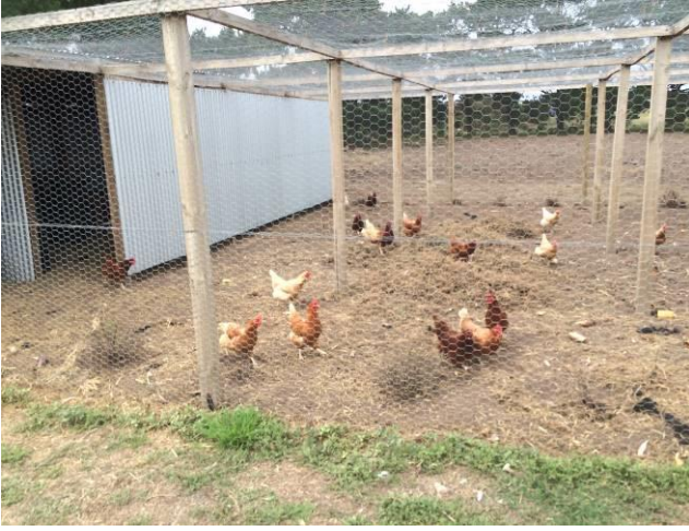
The chicken enclosure