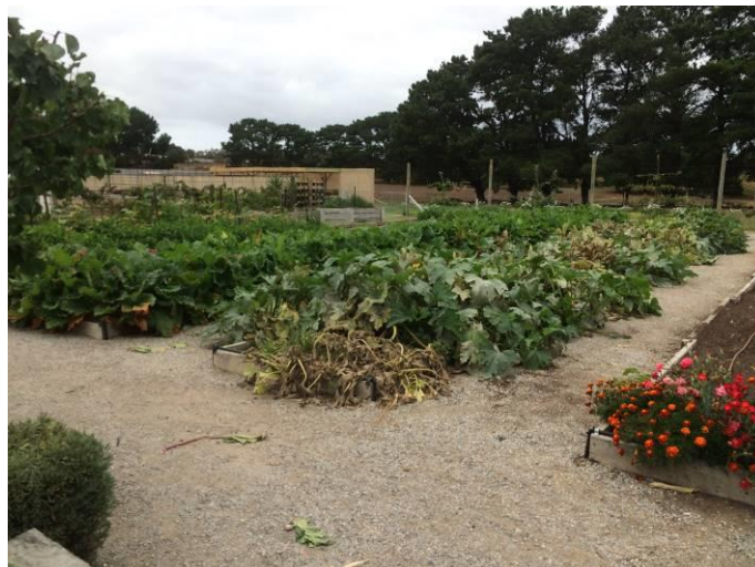
The vegetable gardens

“The Paddock” is a safe, friendly and supportive environment. All staff and clients are involved in encouraging and supporting others and celebrating each other’s achievements. This has a flow on effect which benefits the clients, including improved work satisfaction and a sense of personal accomplishment.