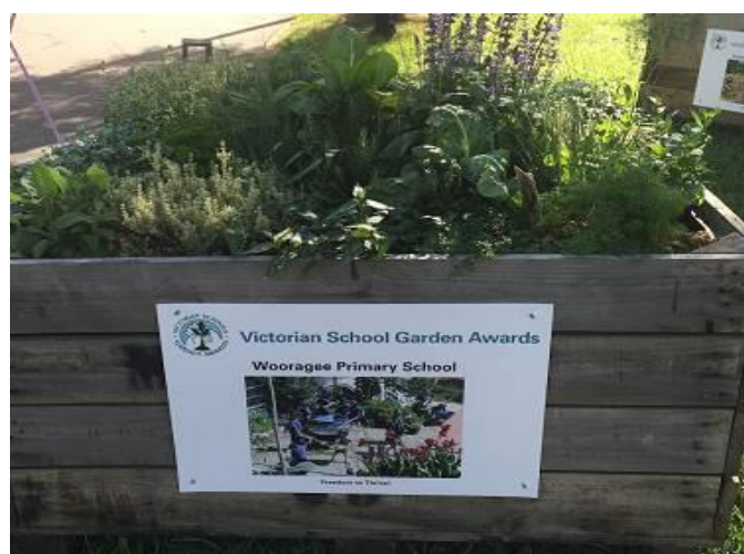
Victorian School Garden Awards