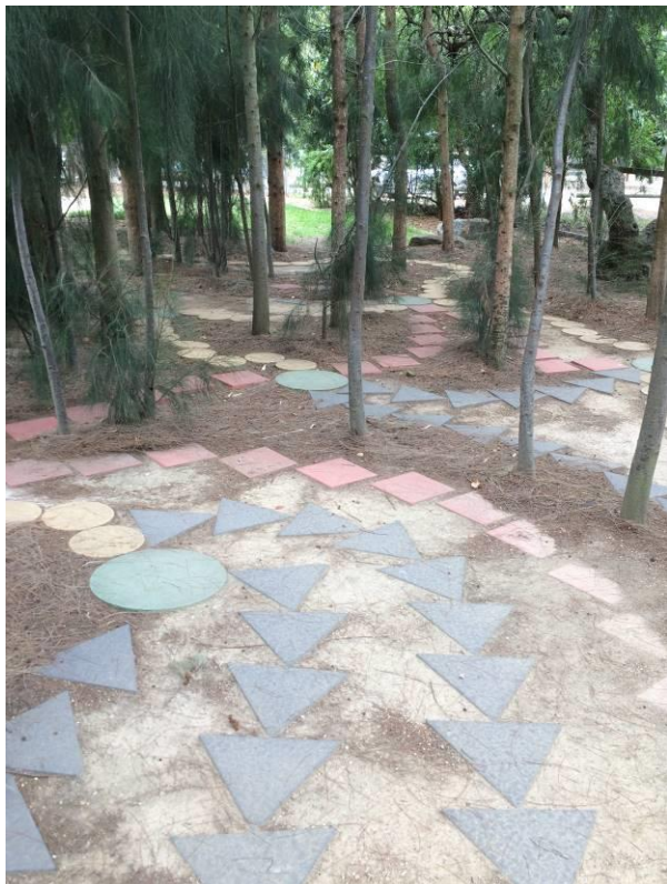
She oak (Casuarina) walk