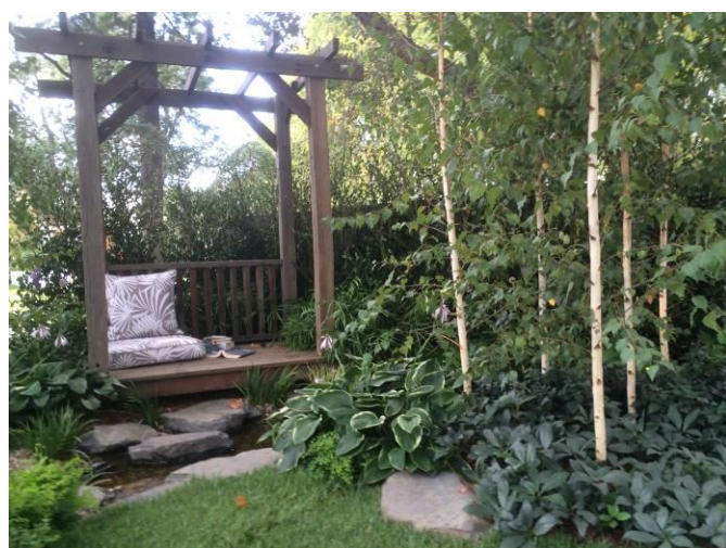
Tranquil show garden – Gold Medal