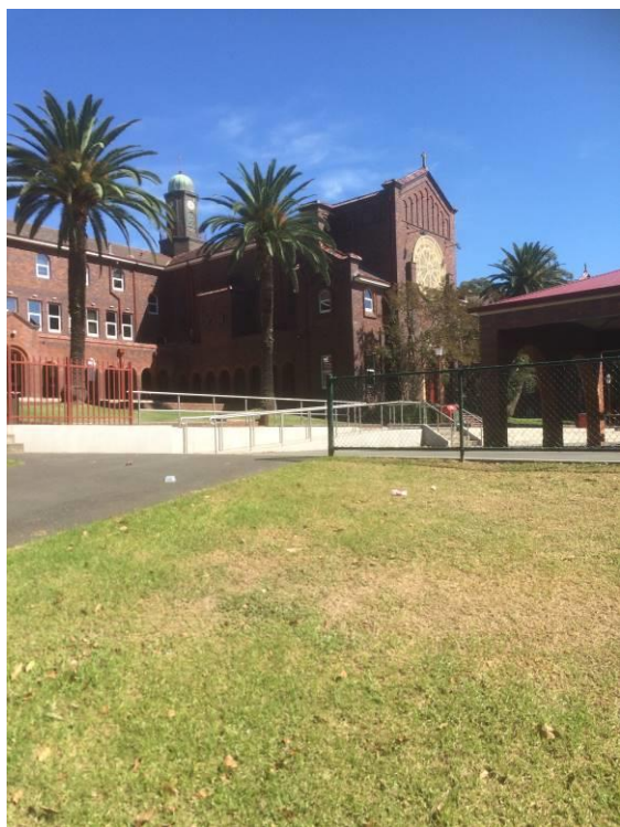
The school buildings

A small orchard has also been established near the Kitchen operations building.