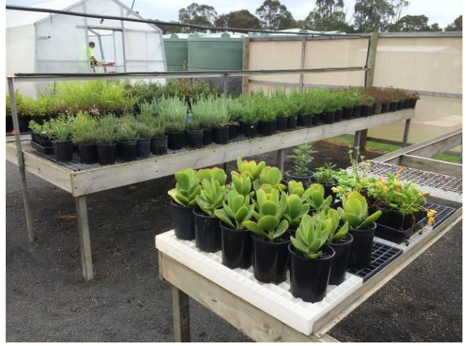
Propagating benches and glasshouse