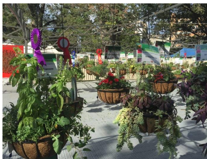
RHSV - Hanging basket competition

Horticultural Therapy Association of Victoria Telephone: (61 3) 9836 1128 www.htav.org.au