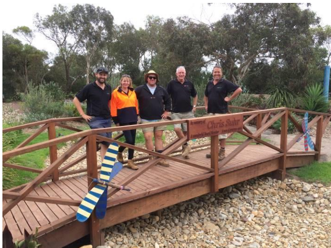
Members of the gardening staff at The Paddock

The workshop was held at their Leopold site “The Paddock” a short distance east of Geelong and included a presentation on the benefits of gardening to special needs groups and involved a propagation activity. The workshop targeted Encompass staff who ranged from experienced gardeners to novices.