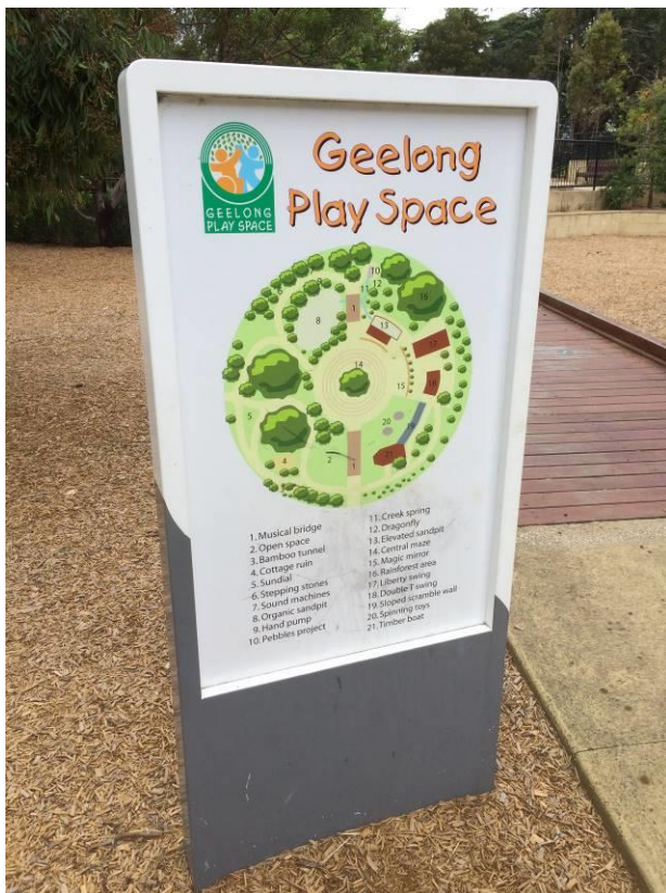
Playspace entrance sign

The garden area is also securely gated so children can play in safety.