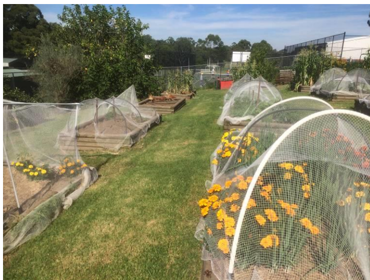
Vegetable garden beds

The college also encourages participation in agricultural shows.