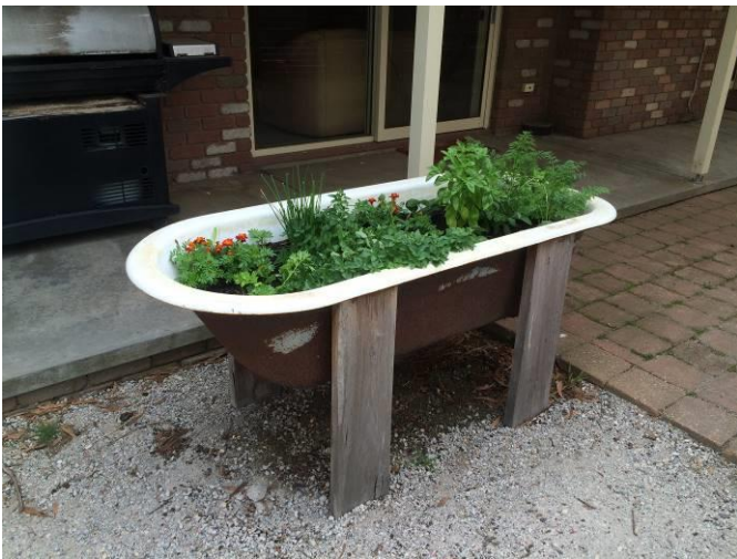
Bathtub raised bed