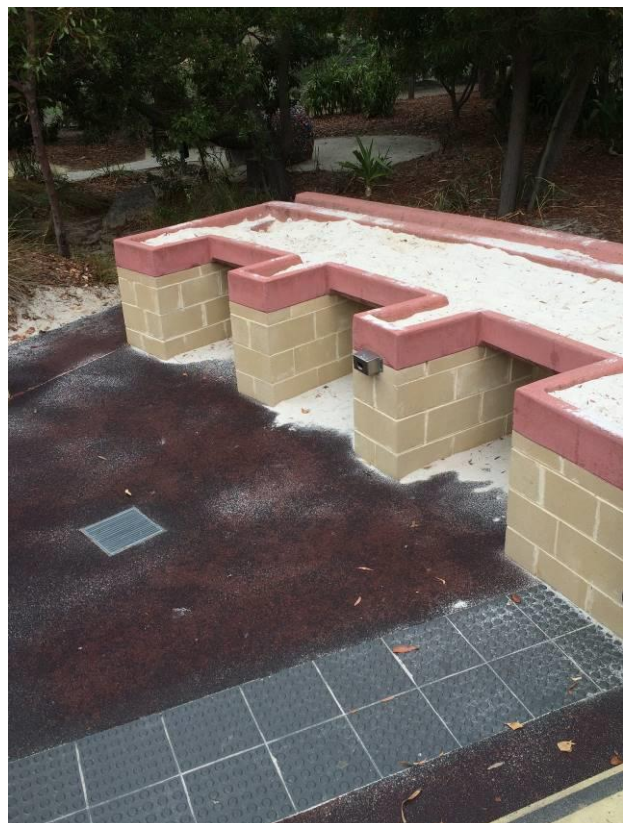
Raised sandpits for wheelchair access