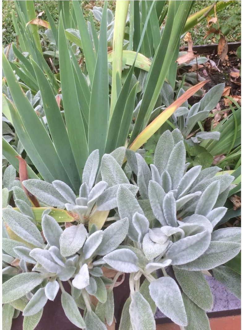
Lambs Ears growing in front of some Irises

It can be very successfully grown in containers and attracts birds and insects.