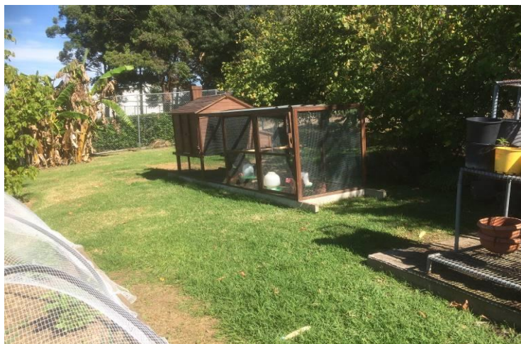
The "chook" tractor