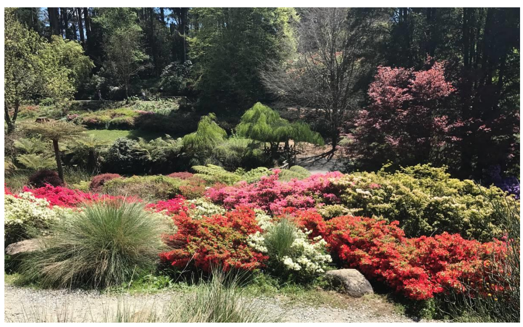
National Rhododendron Gardens - near Olinda Victoria

Rhododendrons are hardy once established but need a little protection from the hot western sun in summer.