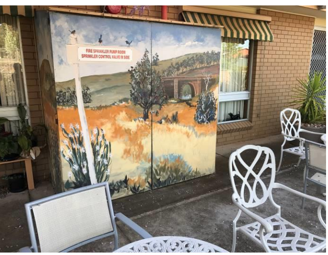
Ornaments and mural in front garden