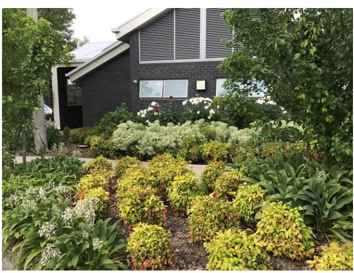
Front ornamental garden