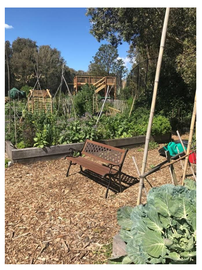
Garden with seat for relaxing

The garden comprises many plots that are rented out to members as well as common communal garden areas that are managed by all members.