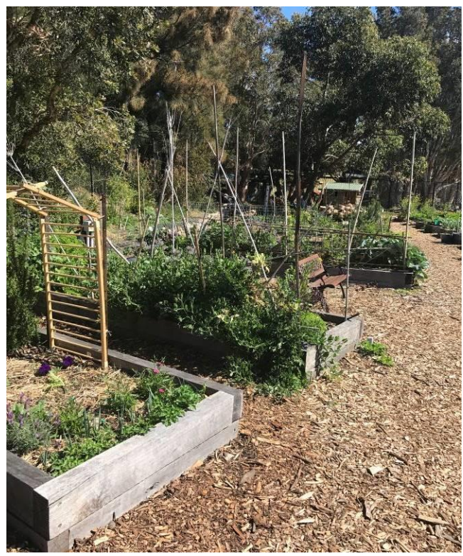
Raised plot based garden beds

The garden is built on sustainable organic principles that are in harmony with the nature of the local area. It provides a place to learn and share knowledge of organic gardening methods, waste reduction, water and solar harvesting and sustainable living.