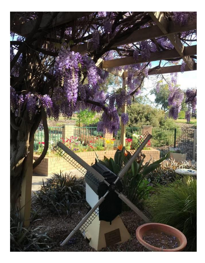
Ornaments under wisteria

Grant Lodge is a member of Dementia Care Australia and through the implementation of the "Spark of Life" approach; staff are able to provide a dementia supportive environment. As well as providing home cooked meals with personal diet preferences, Grant Lodge provides an extensive lifestyle program in Bacchus Marsh.