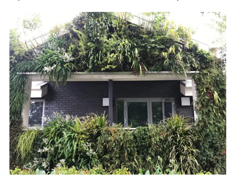
Front entrance vertical garden

Above the entrance to the pavilion is a wonderful vertical garden which includes orchids, ferns, a philodendron and other ornamental plants.